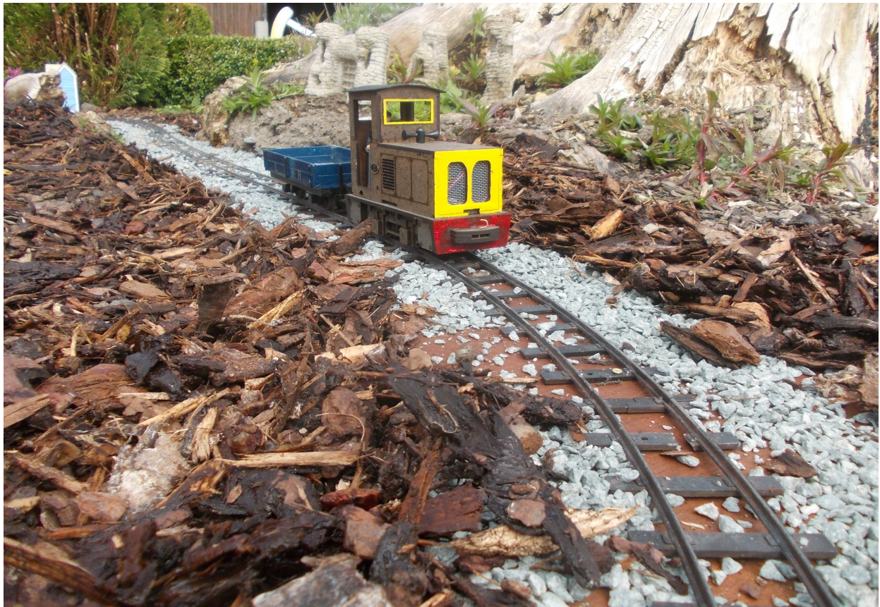
A short freight on the Dow Valley Light Railway

The Newsletter of the Mid Wales and Marches Group of 'G' Scale Society June 2017