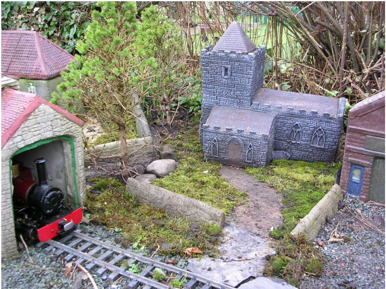
A quiet moment down by the sheds