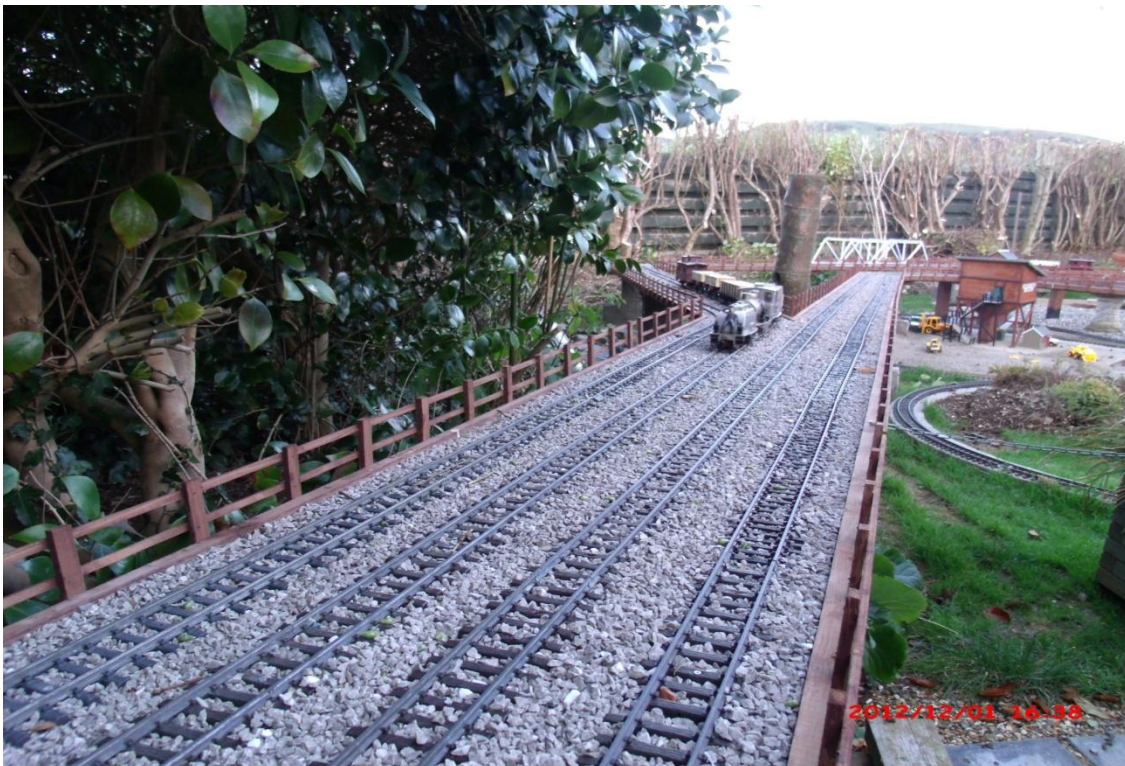
The impressive four road entrance to the shed on Cyril Asprey's Garden Railway in Tywyn