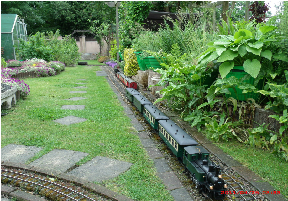
A busy day on the Kenwater Valley Railway